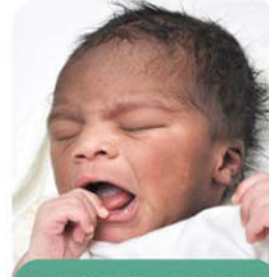
HAND TO MOUTH